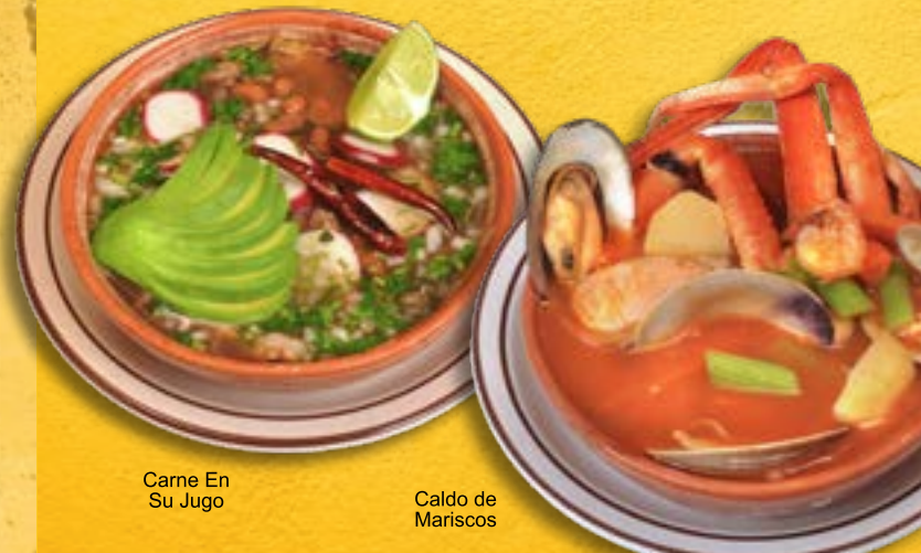
Carne En Su Jugo