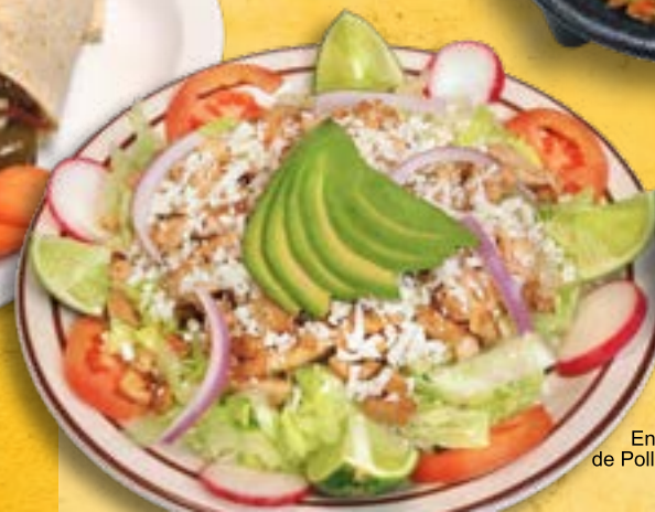
Ensalada de Pollo Mezquite