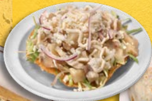
Tostada de Pata de Res