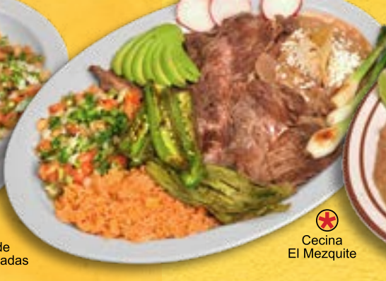
Cecina El Mezquite