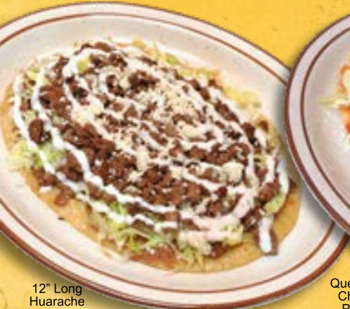
12" Long Huarache