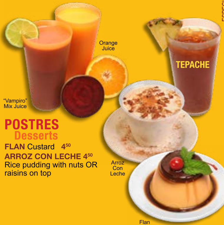
"Vampiro" Mix Juice

MICHELADA MIX 5 25 Clamato, citrus juices, sauces & spices...just add your own beer