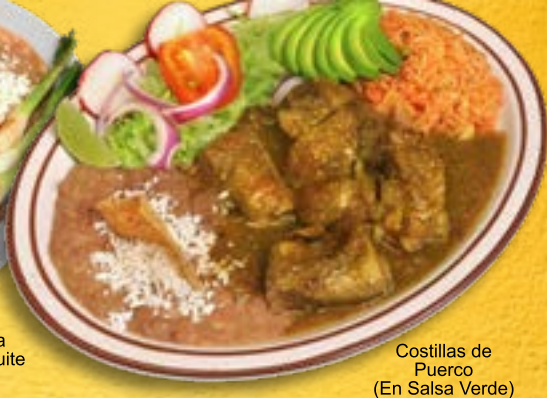
Costillas de Puerco (En Salsa Verde)