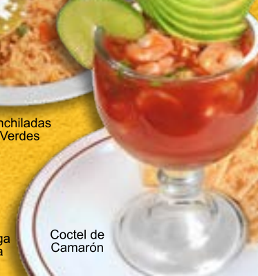
Coctel de Camarón