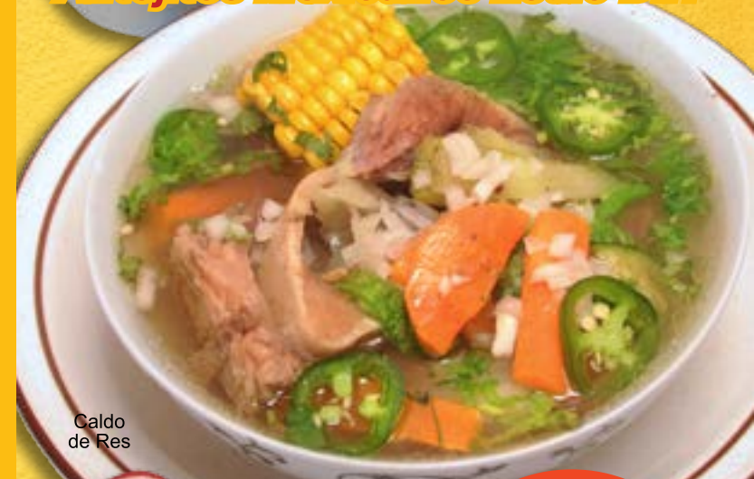
Caldo de Res