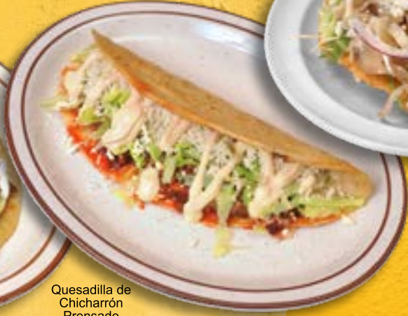
Quesadilla de Chicharrón Prensado