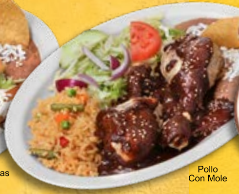
Pollo Con Mole