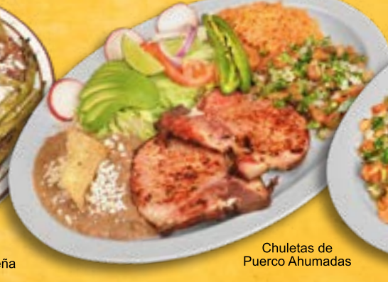
Chuletas de Puerco Ahumadas